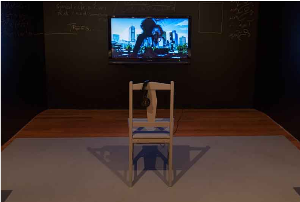
A Few Steps Not Here Not There, RMIT Gallery, 2015.