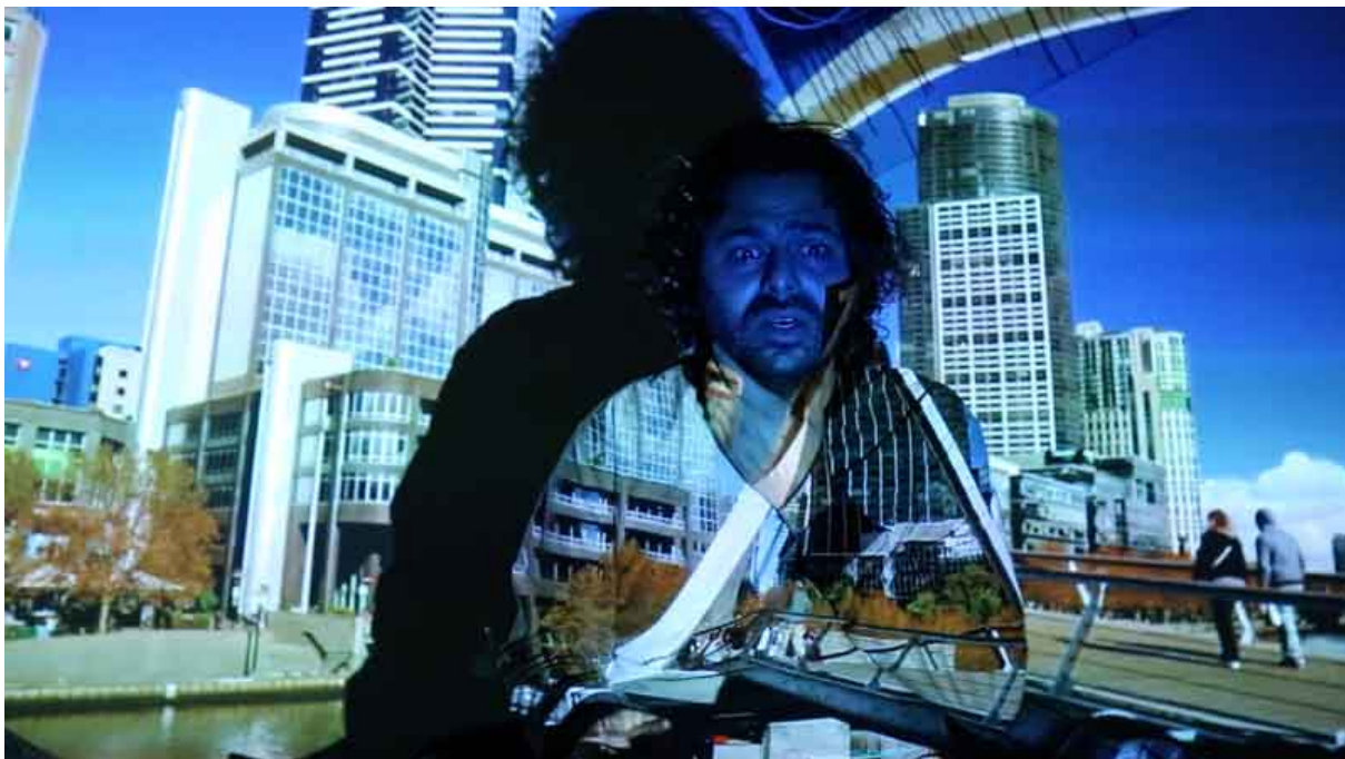
A Few Steps Not Here Not There, still image from 7min digital video, 2015.

>> http://www.performingmobilities.net/symposium/traces_gallery/a-few-steps-not-here-not-there/