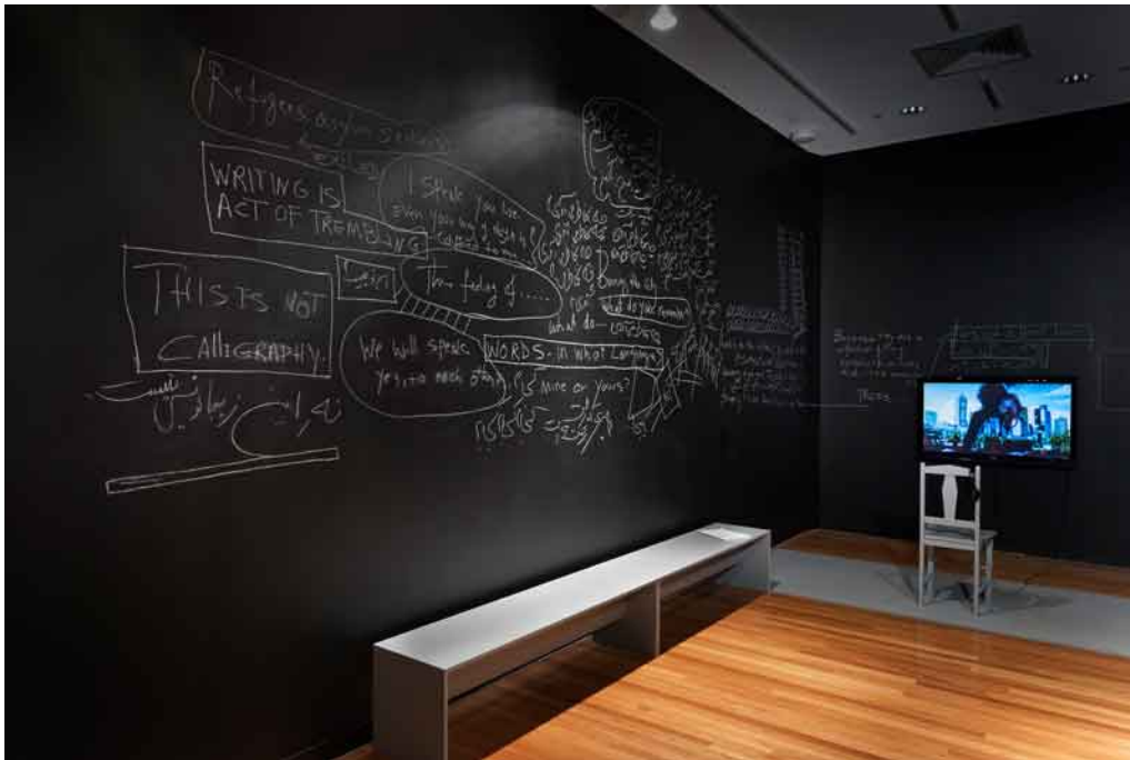
A Few Steps Not Here Not There, RMIT Gallery, 2015.