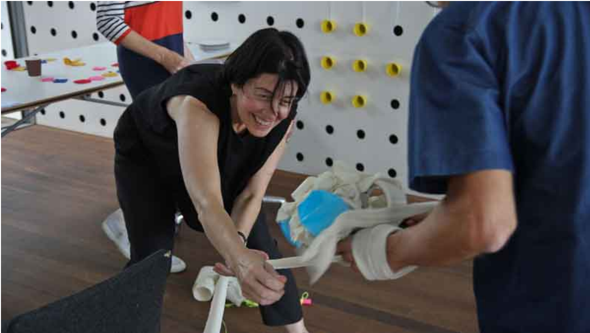
Disc-course, Performing Mobilities, 2015.

>> http://www.performingmobilities.net/symposium/assembly_symposium/disc-course/