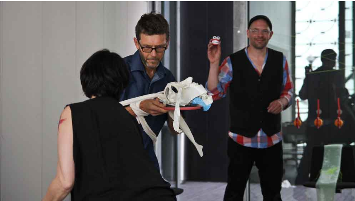
Disc-course, Performing Mobilities, 2015.

>> http://www.performingmobilities.net/symposium/assembly_symposium/disc-course/